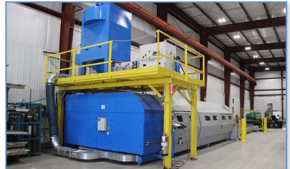
Burch Tank & Truck, Inc.'s new fiber cutter.

Burch Tank & Truck Inc. announced that they expanded their precision cutting capabilities by adding one of the largest fiber cutters in the Midwest to their Mt. Pleasant facility. Not only will this machine allow the company to offer custom cutting and high-quality fabrication parts, but it also will reduce costs and improve efficiencies. Additionally, Burch Tank & Truck Inc. has offered to help support other Middle Michigan businesses and will offer their custom precision cutting services at a reasonable cost. Please contact Burch Tank & Truck for further information.